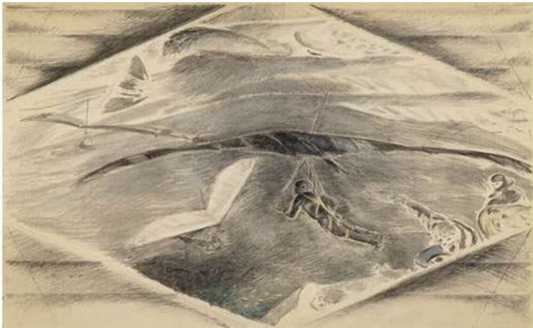
Hang Gliders, graphite & coloured pencil on paper, 63 x 87 cm

WATCH the videos: Jeffery Camp at 90 and RUBICON exhibition