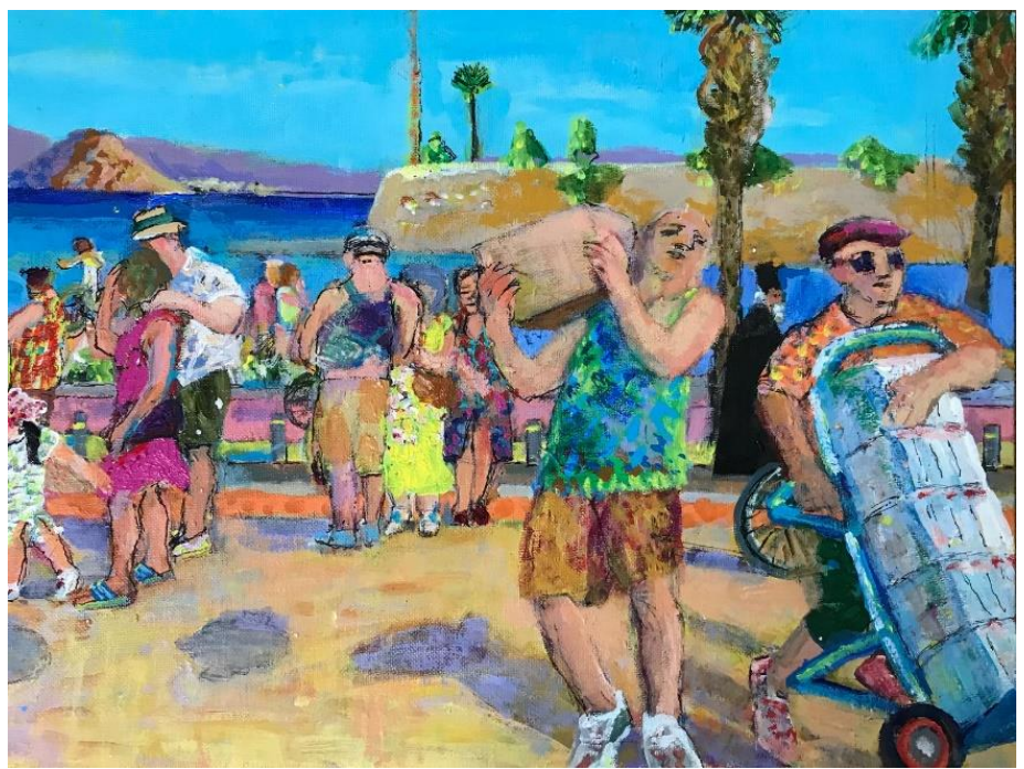
\textit{Kos Harbour, Morning, The Delivery}, \text{ acrylic on canvas on board, } 92 \times 138 \text{ cm}

The figures are painted with a certain rudimentary force but in spite of this he conveys, through the disposition of forms and masterly use of illusionistic space: a quite compelling sense of reality and originality of vision. Timothy Hyman has written that '...we might pick up affinities to early Balthus for example, or Bonnard; to Poussin or to Tintoretto. Like any true Painter of Modern Life Farrell brings to bear all the resources of a lifetime upon a subject that could so easily have been banal but has turned out to be, as he says "limitlessly rich" '.