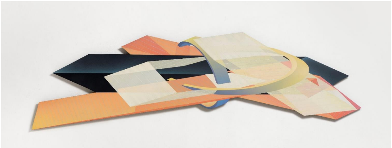
Gift , 2023; acrylic on poplar plywood, 48 x 173 cm

view the catalogue with an essay by Brendan Prendeville online