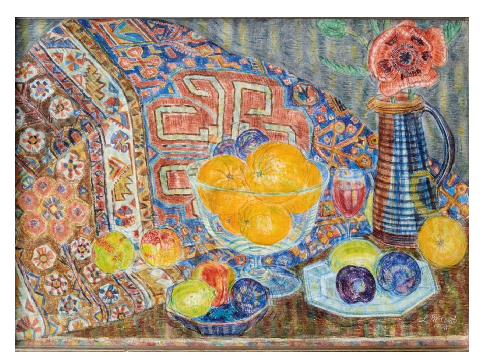
Still Life with Persian Rug, 1998, watercolour on paper, 73 x 104cm